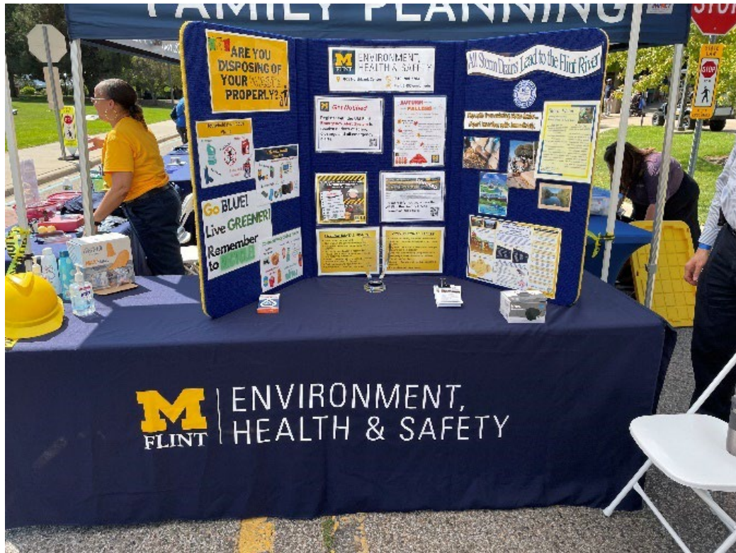
Figure 3 EHS-F table at the MGagement Fair, September 2024.