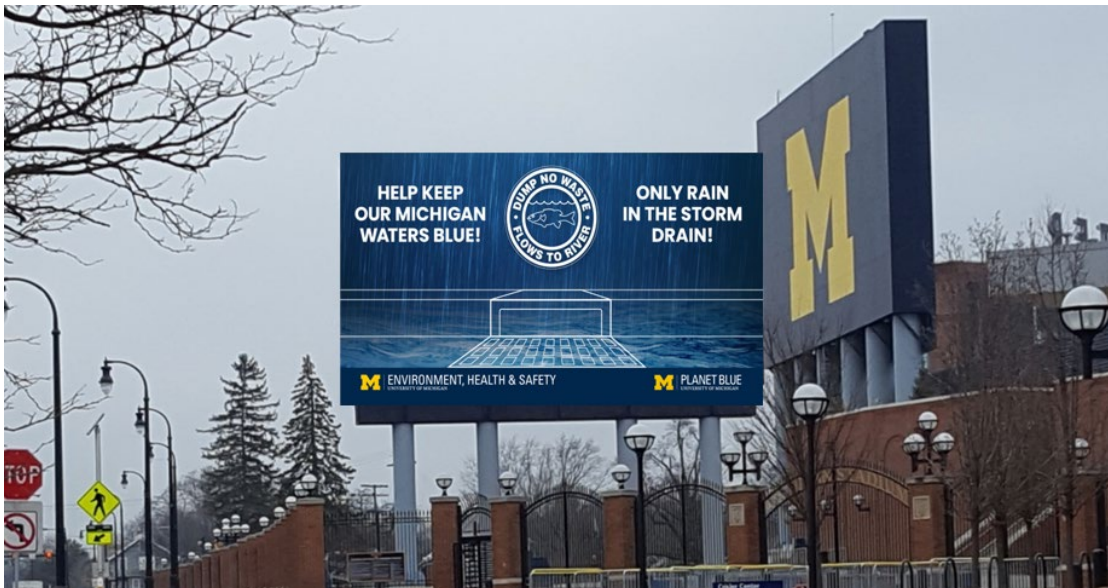
Figure 5 Stadium marquee daily message display.

PSA: “Michigan fans help keep our Michigan waters BLUE by properly disposing of trash and recyclables! Did you know that outdoor drains found in parking lots and along roadways are directly connected to rivers, ponds, and lakes? Nothing but stormwater should ever be discharged into these storm drains. So do your part and help keep our Michigan waters BLUE!”