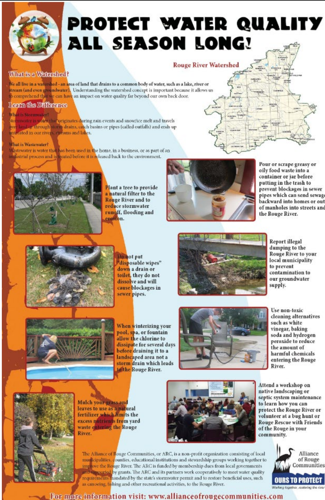
Figure 4 An image of the "Protect Water Quality" poster.