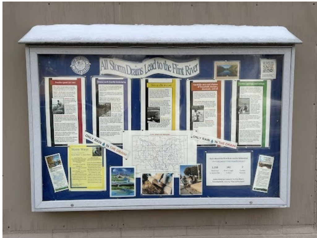
Figure 2 Display case at the Harrison Parking ramp was updated in December 2023.