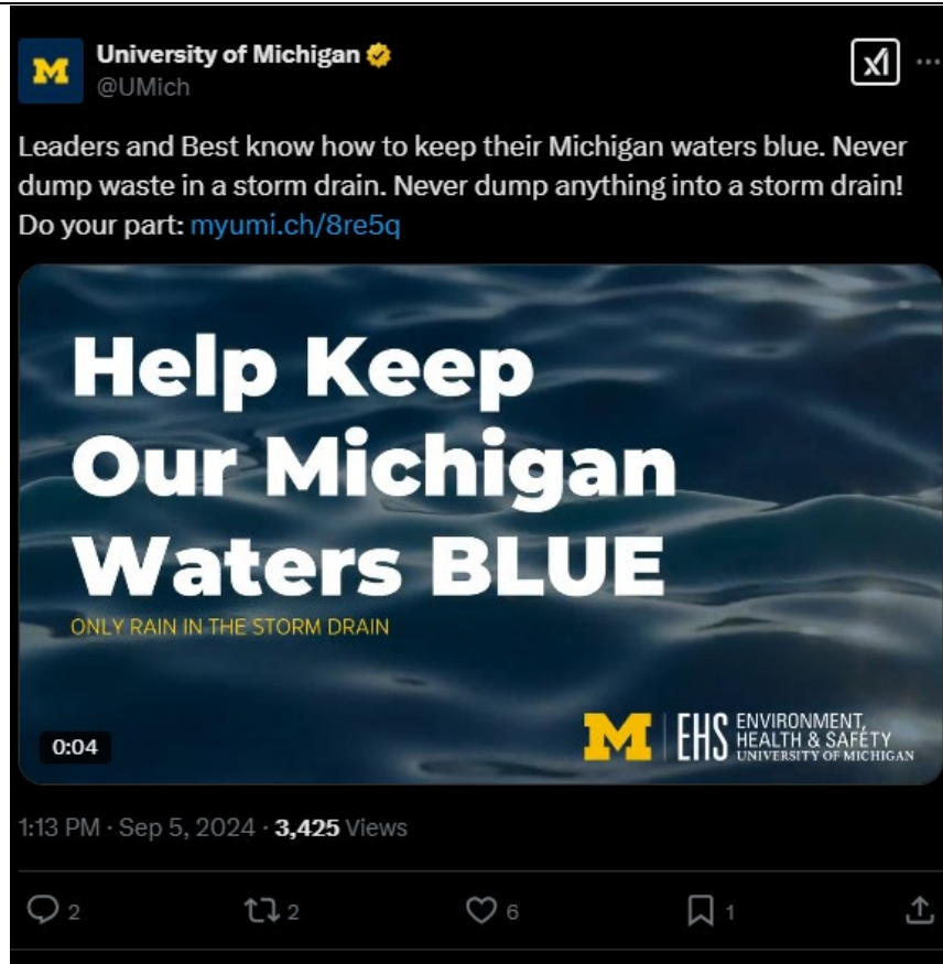
Figure 1 X (Twitter) post on September 5, 2024.