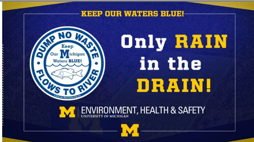
Figure 6 In-stadium digital board message for football game days.