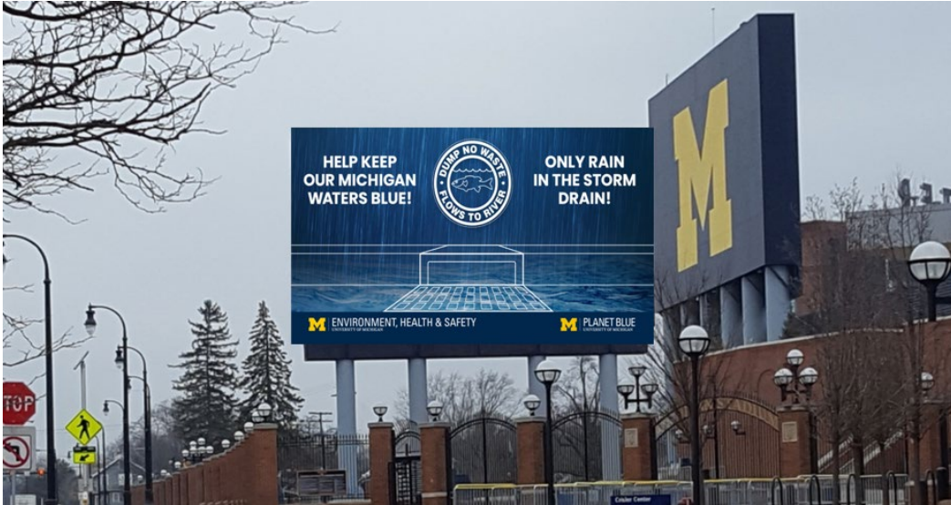
Figure 5 Stadium marquee located outside the football stadium