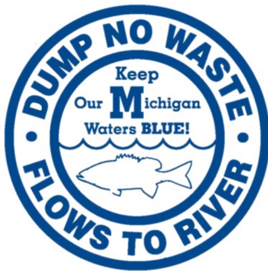
Figure 7 An image of the University of Michigan storm drain marker.