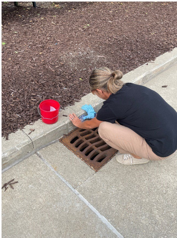
Figure 6 EHS staff member placing a storm drain marker.