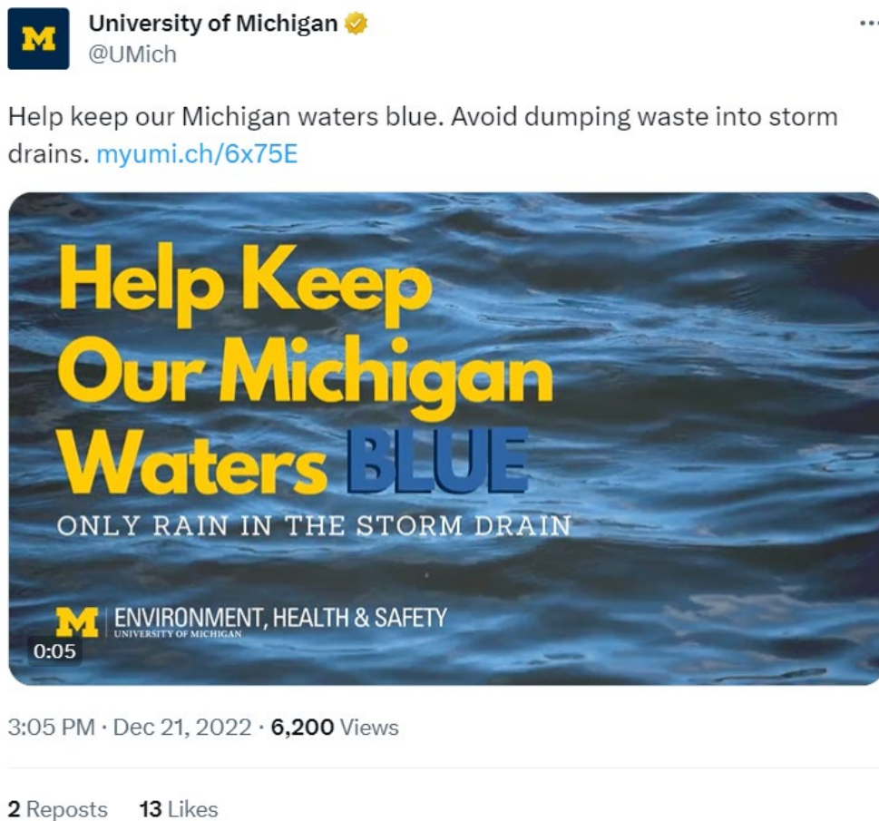
Figure 1 University of Michigan Twitter posting on December 21, 2022.