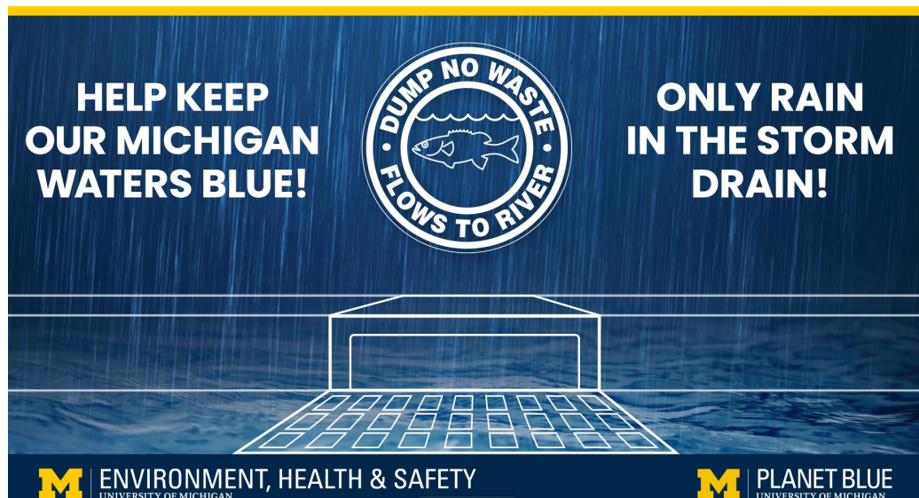
Figure 4 Updated stadium marquee message for off-game times