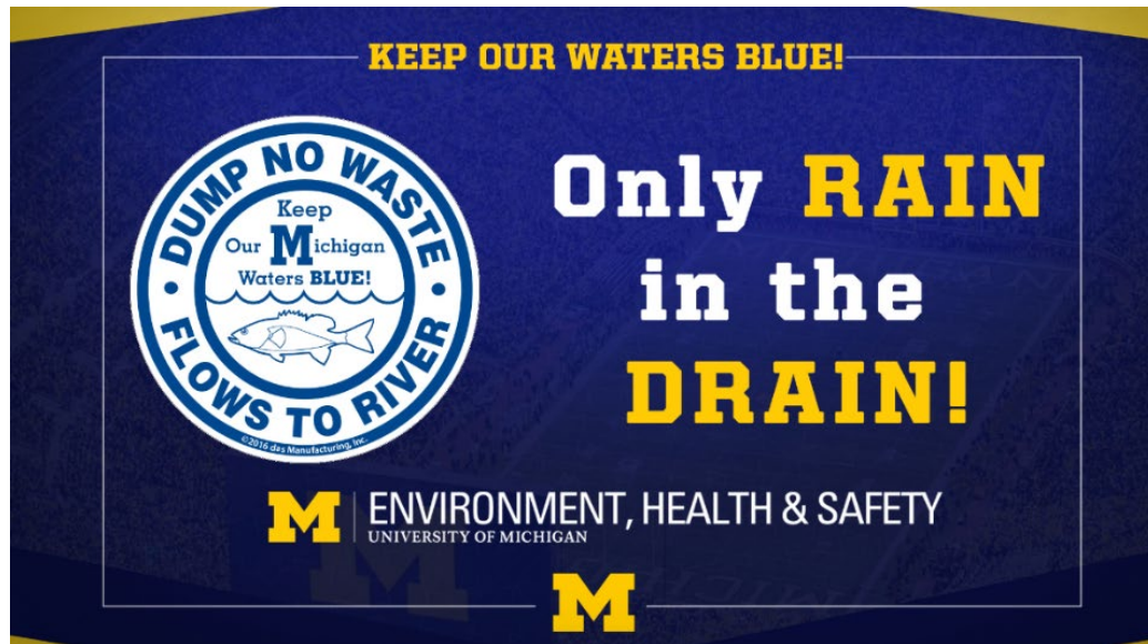
Figure 2 Stadium marquee message for football game days

“Michigan fans, help keep our Michigan waters BLUE by properly disposing of trash and recyclables! Did you know that outdoor drains found in parking lots and along roadways are directly connected to rivers, ponds, and lakes? Nothing but storm water should ever be discharged into these storm drains. So do your part and help keep our Michigan waters BLUE!”