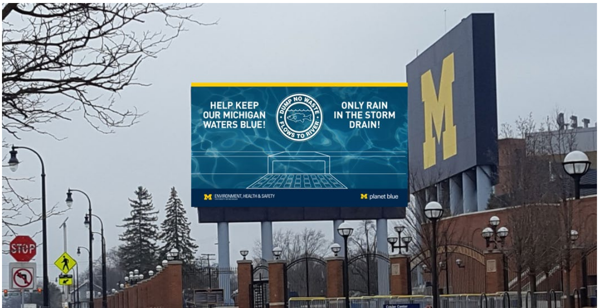
Figure 4 Stadium marquee located outside the football stadium