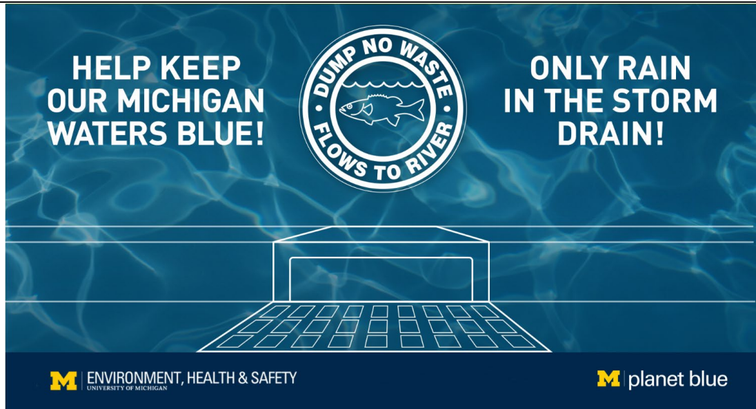
Figure 3 Stadium marquee message for off-game times