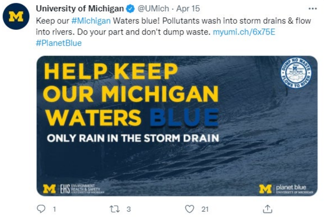
Figure 1 University of Michigan Twitter posting on April 15, 2021.